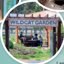
Land to Hand